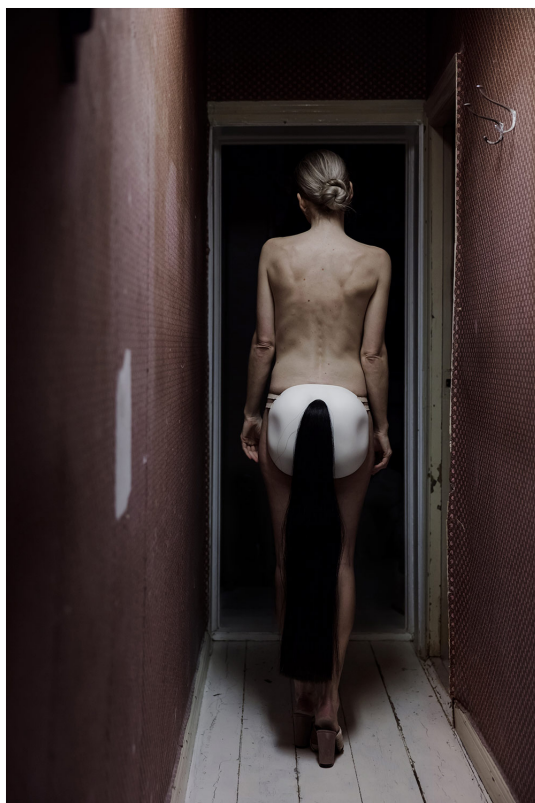
Bruun Ulla Bech Sculpture: Orthosis #2: PONY , 2018 Unglazed porcelain, stallion tail hair, leather, felt. 31 x 92 x 23 cm