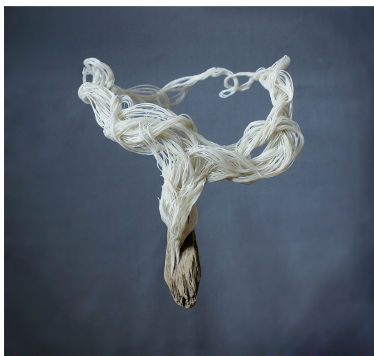
Wiebke Pandikow Necklace: Fountain , 2016 Recycled plastic bags, driftwood. 19 x 36 x 60 cm Photo by: Wiebke Pandikow Melting and shaping of plastic bags with flat iron, soldering iron. © By the author. Read Klimt02.net Copyright.