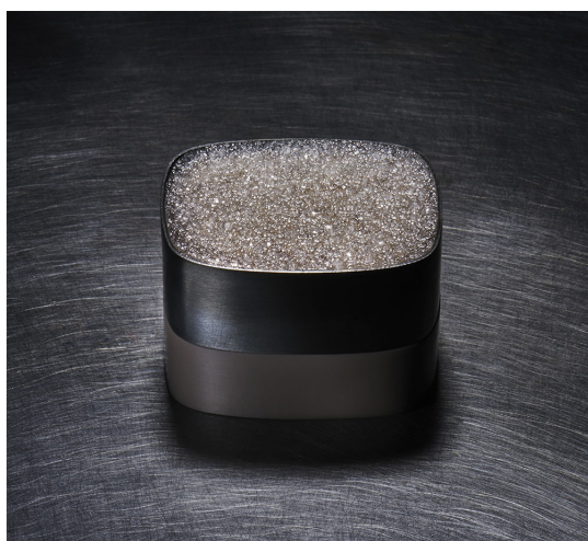
Dominique Labordery Object: ATHENA , 2016 Silver, agate, corian.