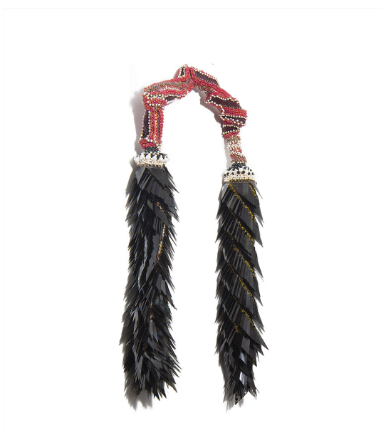
Sébastien Carré Necklace: Cultural Balance , 2018 Shagreen, natural pearls, rock pearls, film strip, cotton, silk, nylon threads. 80 x 3 - 5 cm Cutting of the film modules and assembling by hook, embroidery and weaving technique. © By the author. Read Klimt02.net Copyright.