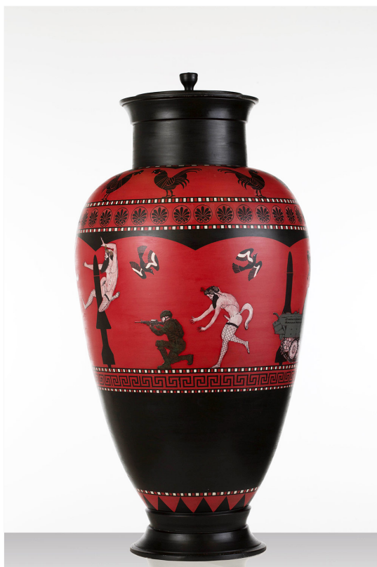
Ray Church Vessel: Big Weapons , 2018 Earthenware decorated with slips, underglaze, decal and gold luster. Wheel thrown. Aprox 90cm x 50cm wooden box Clay amphora.