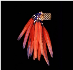
Unconfined Horizons. Jewellery from Humboldt's Travel Routes 13APR2019 - 08SEP2019 Pforzheim Jewellery Museum Pforzheim, GERMANY