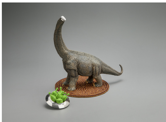
Felieke van der Leest Object: Brachiosaurus Tree with UFO Nest and Alien Eggs , 2016 Textile, plastic animal, Argentium   silver, glass beads, leather, magnets crocheted, metalwork, embroidered. 20 x 20 x 31 cm