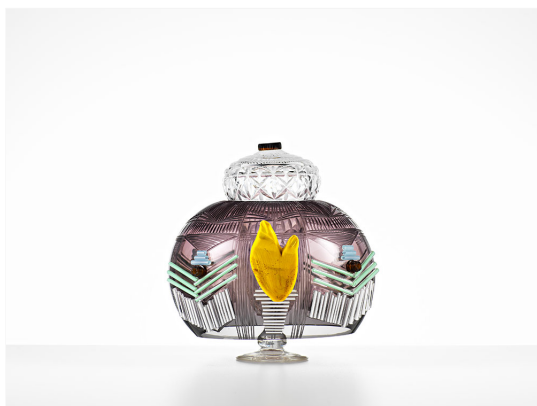
Bolanos Durman Sculpture: Yellow Feathered Queen , 2016 Found and blown glass, cutting. 22.9 x 25.4 x 25.4 cm Photo by: S. Tofts

© By the author. Read Klimt02.net Copyright.