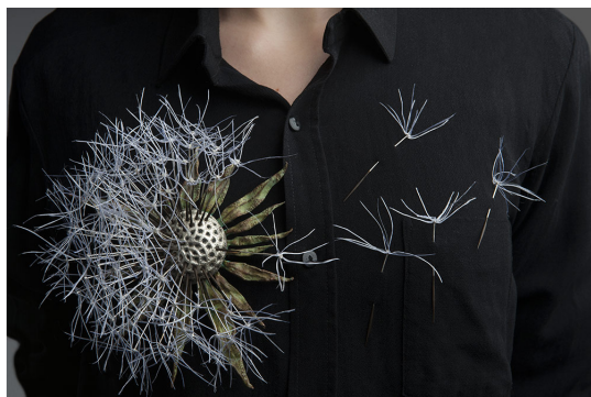
Dorottya Hoffmann Brooch: Dandelion , 2018 Copper, green patina; silver, silicone; pigments, glue, silken thread, acrylic laquer, stainless steel.

18 x 18 x 10 cm Repoussage, rolling, sawing, patinating; doming, etching, drilling, silicone casting; wire drawing, soldering, sawing, gluing, laquering.