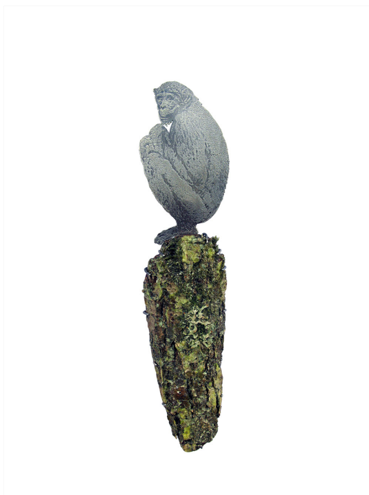
Lena Lindahl Brooch: The Observer , 2018 Etched wood, silver.

4 x 3 x 2.7 cm Photo by: Dominique Labordery © By the author. Read Klimt02.net Copyright.