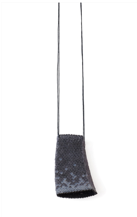
Karin Seufert Necklace: n.T. , 2017 PVC, thread. 9.5 x 5.7 x 3.2 cm