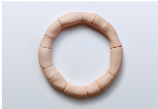
Marion Delarue Neckpiece: Exquisite Corpse , 2015 Casted & polished Korean pink porcelain, stringing elastic cord for articulated porcelain doll. 23 x 23 x 4 cm    By the author. Read Klimt02.net Copyright.

Tuesday - Saturday: 10 am - 5.30 pm. Sunday + Bank Holidays: 11 am - 5.30 pm. Closed Mondays