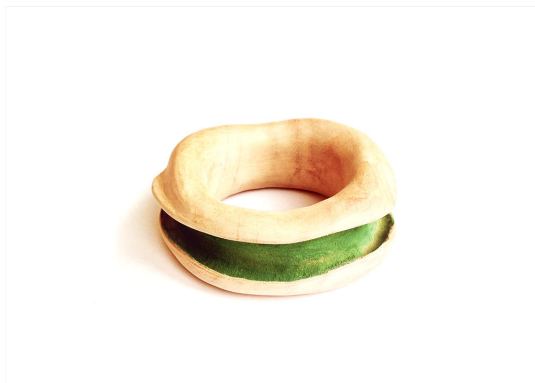
Flóra Vági Bracelet: Green Swan , 2017 Ash 10.5 x 5 cm © By the author. Read Klimt02.net Copyright.

An object with brooch. © By the author. Read Klimt02.net Copyright.