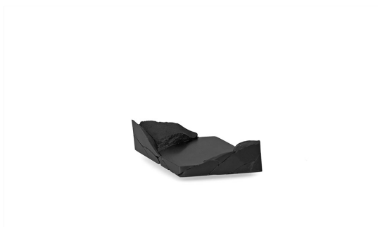
Patrícia Domingues Brooch: Imagined&Erosion , 2018 Reconstructed onyx, steel. 7 x 4 x 3 cm Photo by: Patrícia Domingues From series: Imagined&Erosion All pieces have been broken with the help of chisels and after reconstructed.

© By the author. Read Klimt02.net Copyright.