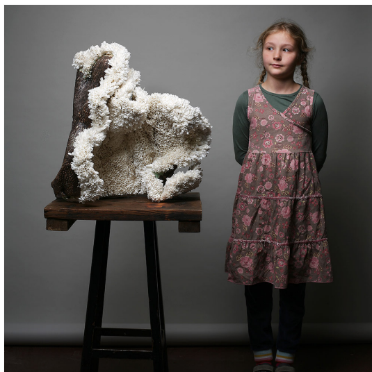
Claudia Biehne Sculpture: Untitled , 2017 Object assembled from numerous, individually made segments; handbuilt porcelain. 53 x 42 x 56 cm Photo by: S. Passig From series: Between the Tides © By the author. Read Klimt02.net Copyright.

From series: Orthosis © By the author. Read Klimt02.net Copyright.