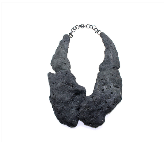
Jordi Aparicio Necklace: Anima 186 , 2017 Principal volumes made with Silver 930/000 wire of 0.08mm (like a human hair) and chain made of silver 930/000 with, a special casting of charcoal and stainless steel. 39 x 25 x 6 cm Photo by: Jordi Aparicio From series: Anima © By the author. Read Klimt02.net Copyright.