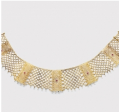
A Newly Ordered World. Jewellery from the Napoleonic Era 19OCT2019 - 31MAR2020 Pforzheim Jewellery Museum Pforzheim, GERMANY