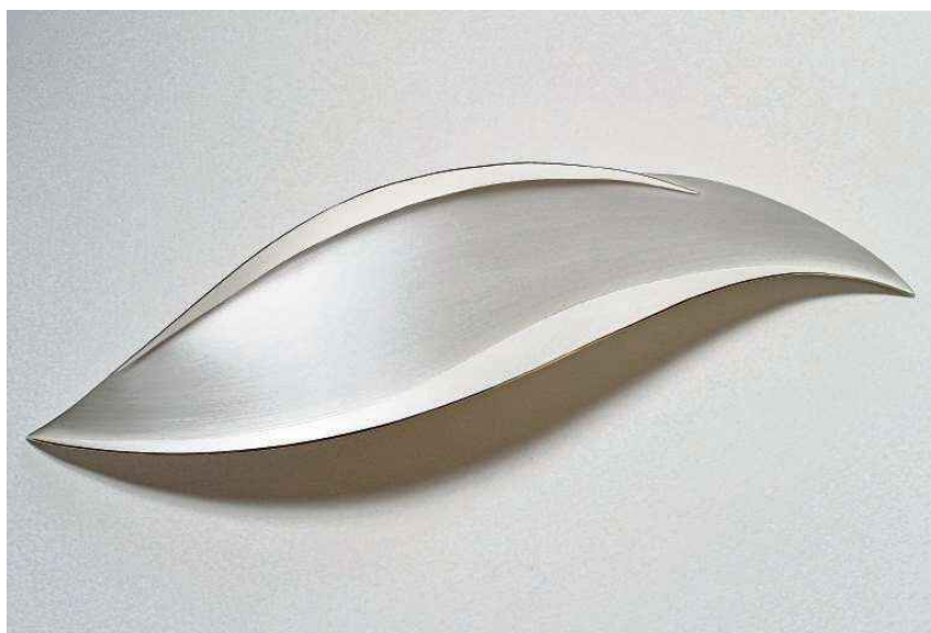
Kilkenny-based Annemarie Reinhold's exquisite Leaf dish, part of the exhibition in the city next week

In partnership with the OPW, the showcase of over 170 exceptional objects will be displayed at two locations